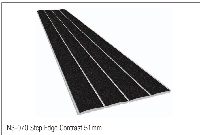
N3-070 Step Edge Contrast 51mm