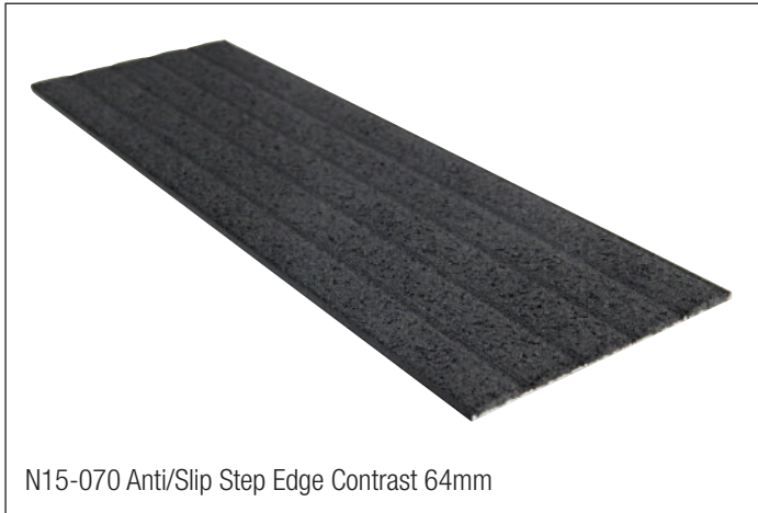
N15-070 Anti/Slip Step Edge Contrast 64mm